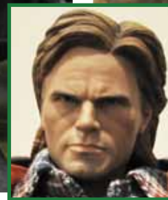
FIGURE MODELING: UNITS or INDIVIDUALS?

Every so often I get to wondering how people go about the hobby in comparison to my own approach and the question I most often think about is, do you model Units or Individuals? There is no wrong or right answer and one method is not necessarily better than another, we just do things differently. I like to build small units of a large variety of subjects, in other words, I'm into WWII