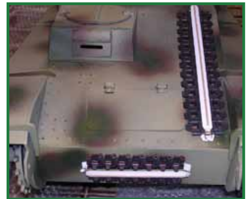
Spare track and track holders made out of styrene and brass.