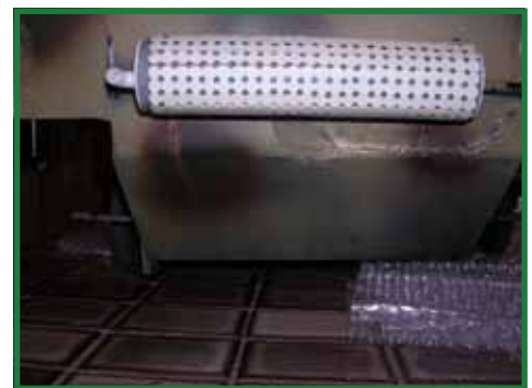
New muffler made from PVC, styrene and a cardstock muffler guard.

Look for another installment next month!