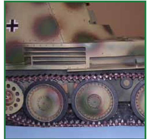
Re-pinned track and repaired wheels, notice the return roller that was added.

Another area that was heavily damaged was the rear of the vehicle. In the last picture you can see a fairly good crack that I have been working on repairing. The muffler was completely smashed. A new one was fashioned out of PVC pipe and styrene. It will be painted black and then "rusted" to finish it off.